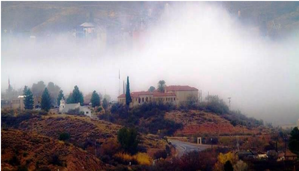
Winter fog over Clarkdale

“The most important one,” answered Jesus, “is this: ‘Hear, O Israel: The Lord our God, the Lord is one. Love the Lord your God with all your heart and with all your soul and with all your mind and with all your strength.’ The second is this: ‘Love your neighbor as yourself.’ There is no commandment greater than these.”