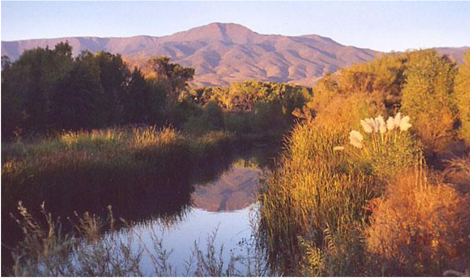
Verde River at Sunrise

It rises at one end of the heavens and makes its circuit to the other; nothing is deprived of its warmth. (Psalm 19:6)